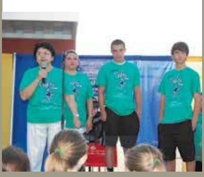
What is David Week?

We are proud to have raised approximately $610,000 for Texas Children's Hospital!